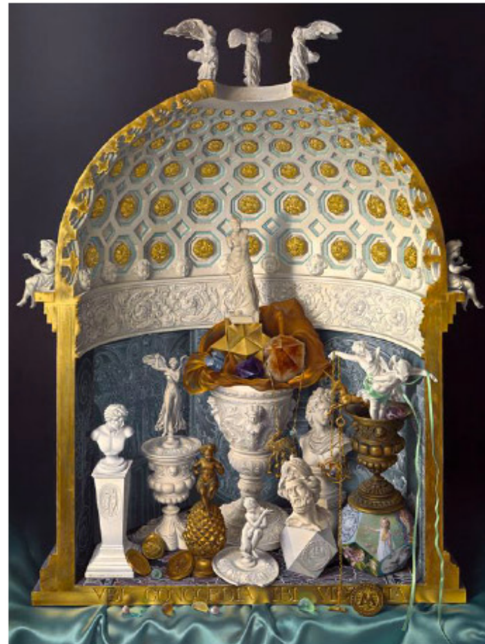
'De Nobis Fabula Narratur' Oil on canvas over panel