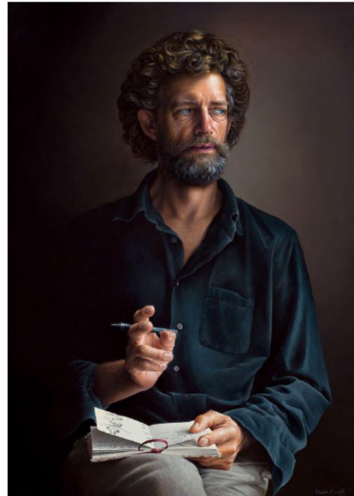
'Anthony' Oil on linen over panel