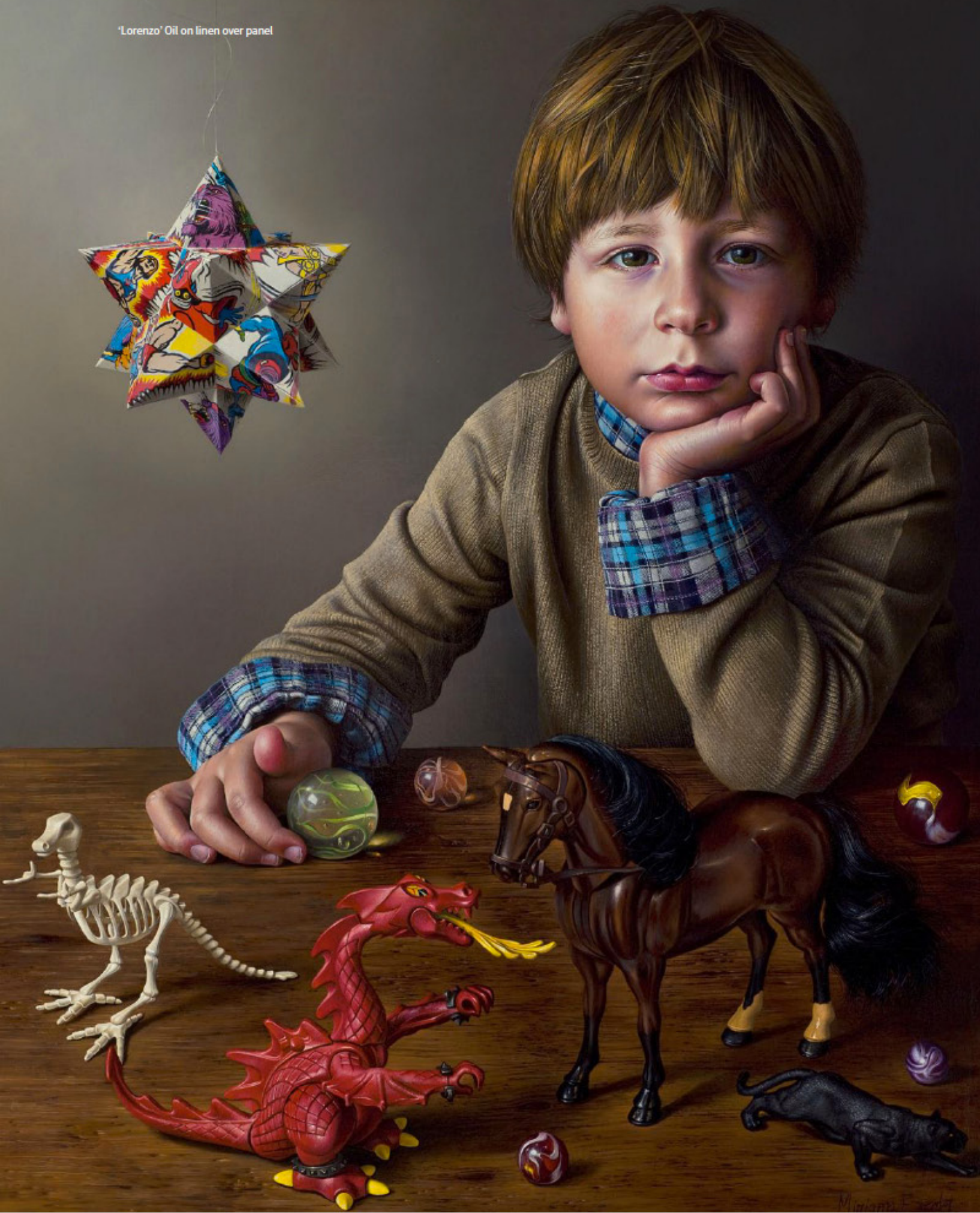
'Lorenzo' Oil on linen over panel