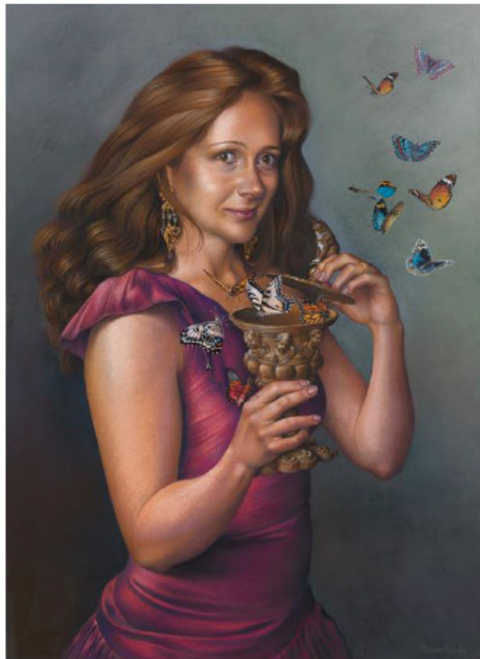
'Debs Remembered' Pastel on board