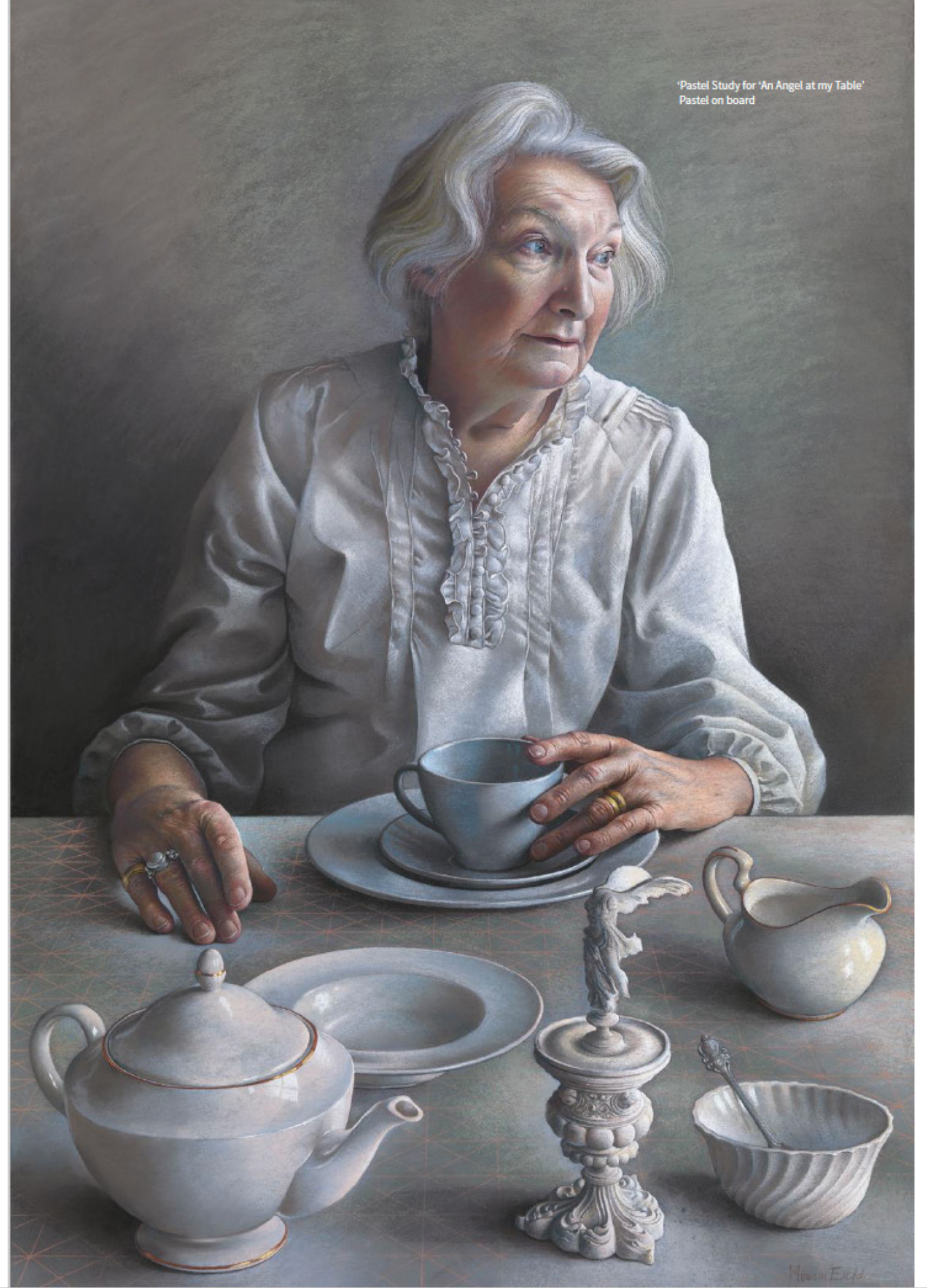
'Pastel Study for 'An Angel at my Table' Pastel on board