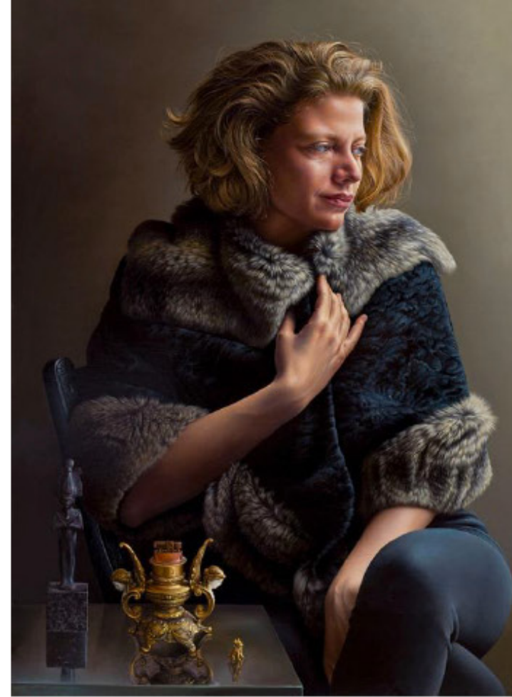
'Gillian' Oil on linen over panel