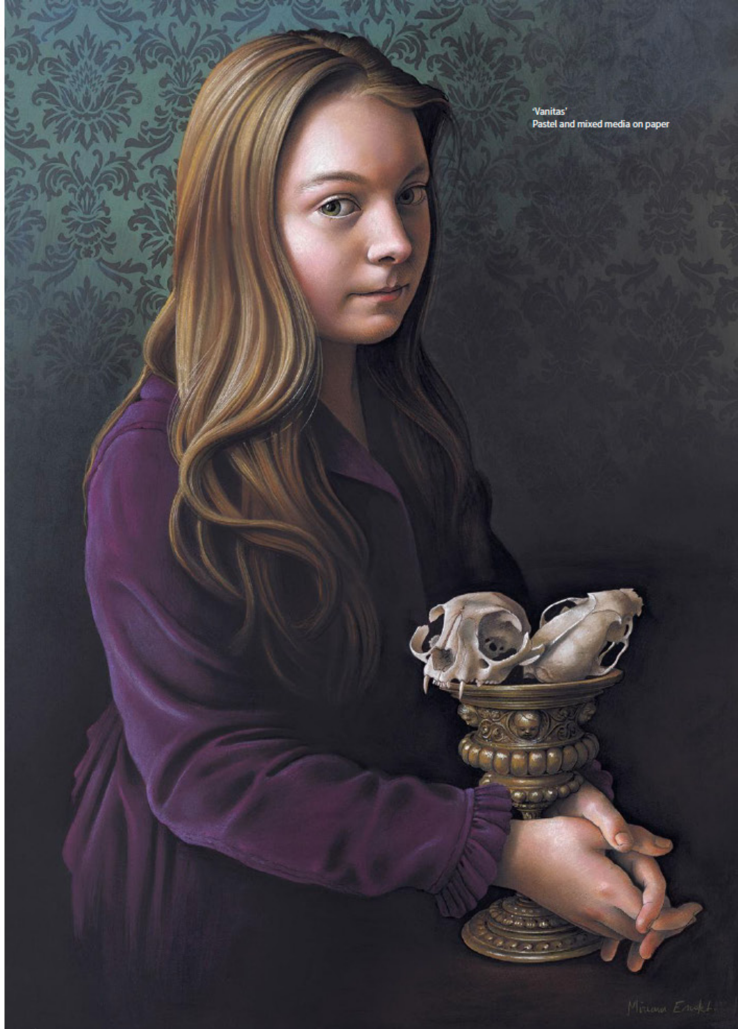
'Vanitas' Pastel and mixed media on paper