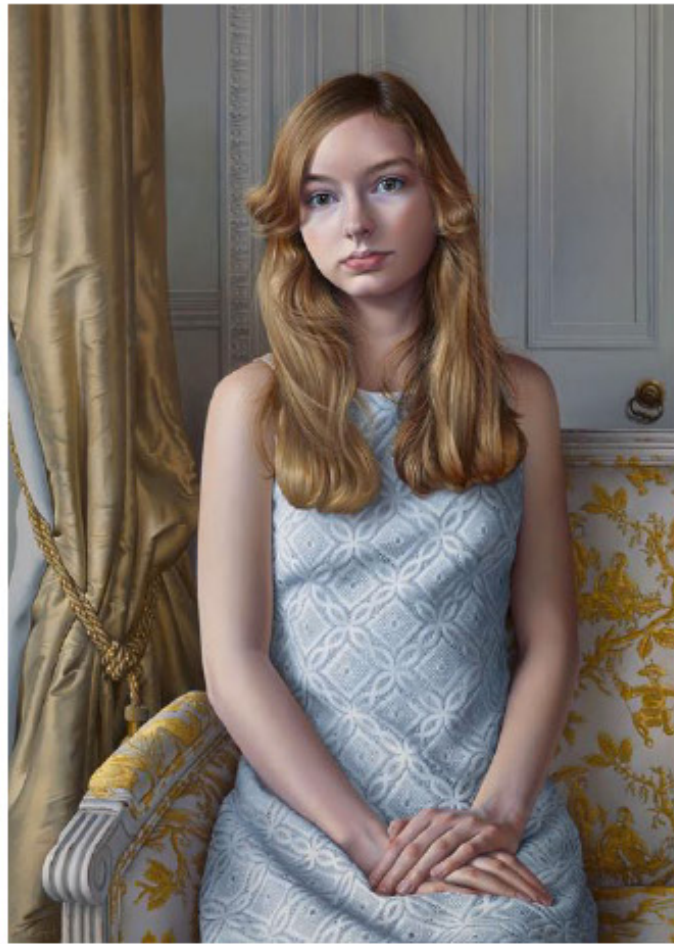
'Sophia' Oil on linen over panel