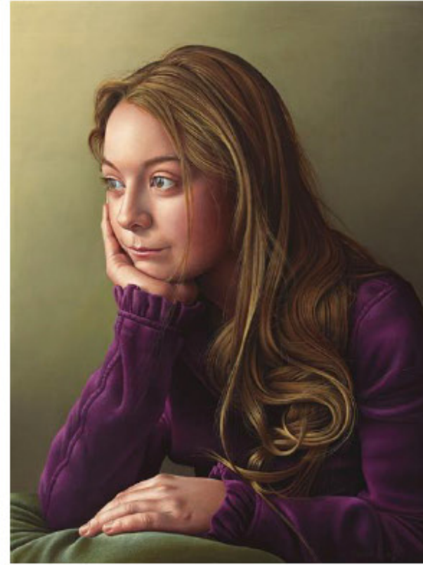
'Maddison Triptych' Left Panel Oil on linen over panel